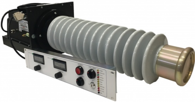
960W and 480W Models

150 - 960W, 100 - 150kV versatile PSU range